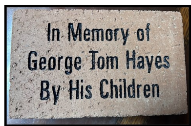
We love you too.